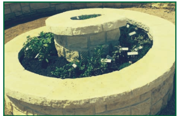
The permaculture-designed herb bed allows herbs to grow in many different microclimates all in one bed.

Community gardening days are Wednesdays and Saturdays, 9 to 11 am. A garden mentor will be on hand.